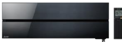
MSZ-LN VG2B - Onyx Black