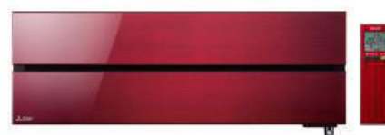
MSZ-LN VG2R - Ruby Red