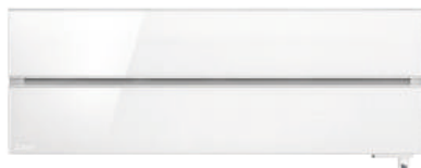
MSZ-LN VG2V - Pearl White